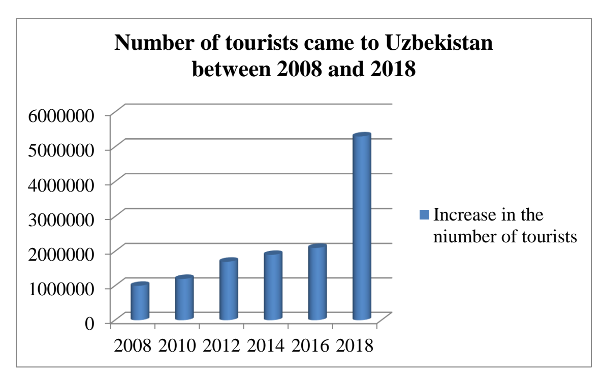
Figure 1. Number of tourists came to Uzbekistan between 2008 and 2018

Several researches have been carried to analyze deeply tourism industry of the Republic of Uzbekistan. Exactly, a research carried to reveal the growth in numbers of tourists who came to Uzbekistan identified that this indicator is increasing year by year and it can be seen in the following figure 1[6].